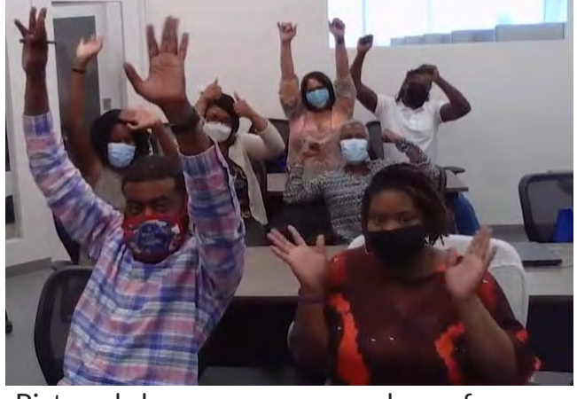
Pictured above are some members of our first Tech Up cohort during one of their training sessions!