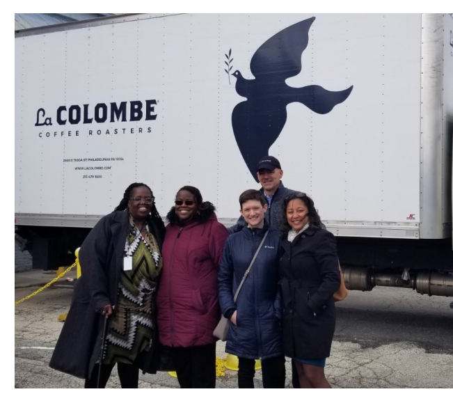
During FY20, we formed a new employer pipeline partnership with La Colombe. This nationwide coffee chain is headquartered in Philadelphia and provides living-wage careers!