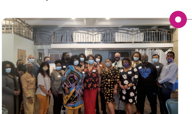
Our {\it first} {\it TechUp cohort and volunteer Sales force trainers.}

Along with our neighbors, we are committed to promoting a safer neighborhood and a stronger community by engaging young adults (16–24 years old) impacted by gun violence in paid apprenticeships ($15 per hour), permanent job placements, mentorships, and community cohesion events.