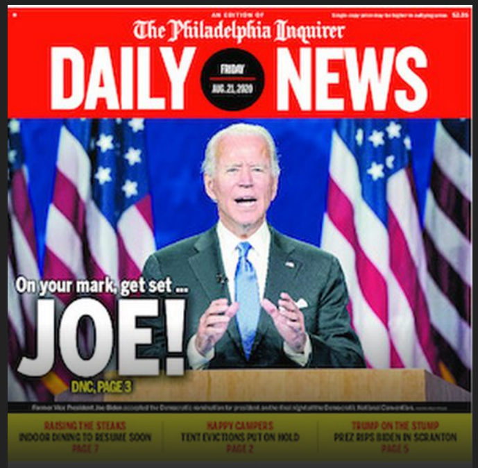
THE DAILY NEWS