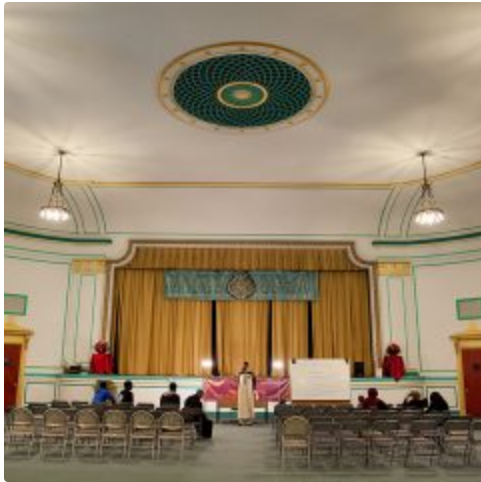
A man enters the Philadelphia Masjid, one of the properties participating in the Infill Philadelphia Sacred Places/Civic Spaces competition.

(https://religionnews.com/webrns-sacred-spaces3-010219/)