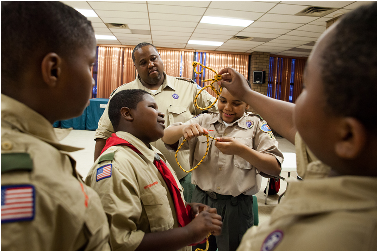
Scouts work on knots at Zion Baptist Church, one of the properties participating in the Infill Philadelphia Sacred Places/Civic Spaces competition.

spaces were in need of “significant investment” and that “as buildings deteriorate and attendance at religious services shrinks, a significant number of congregations will have to determine what to do with their worship homes in the years ahead.”