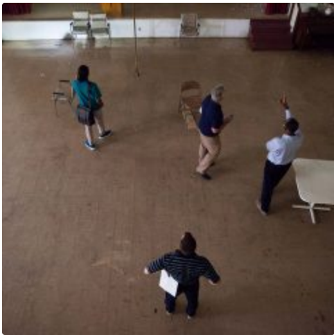
Men play basketball at Zion Baptist Church, one of the properties participating in the Infill Philadelphia Sacred Places/Civic Spaces competition.

(https://religionnews.com/webrns-sacred-spaces12-010219/)