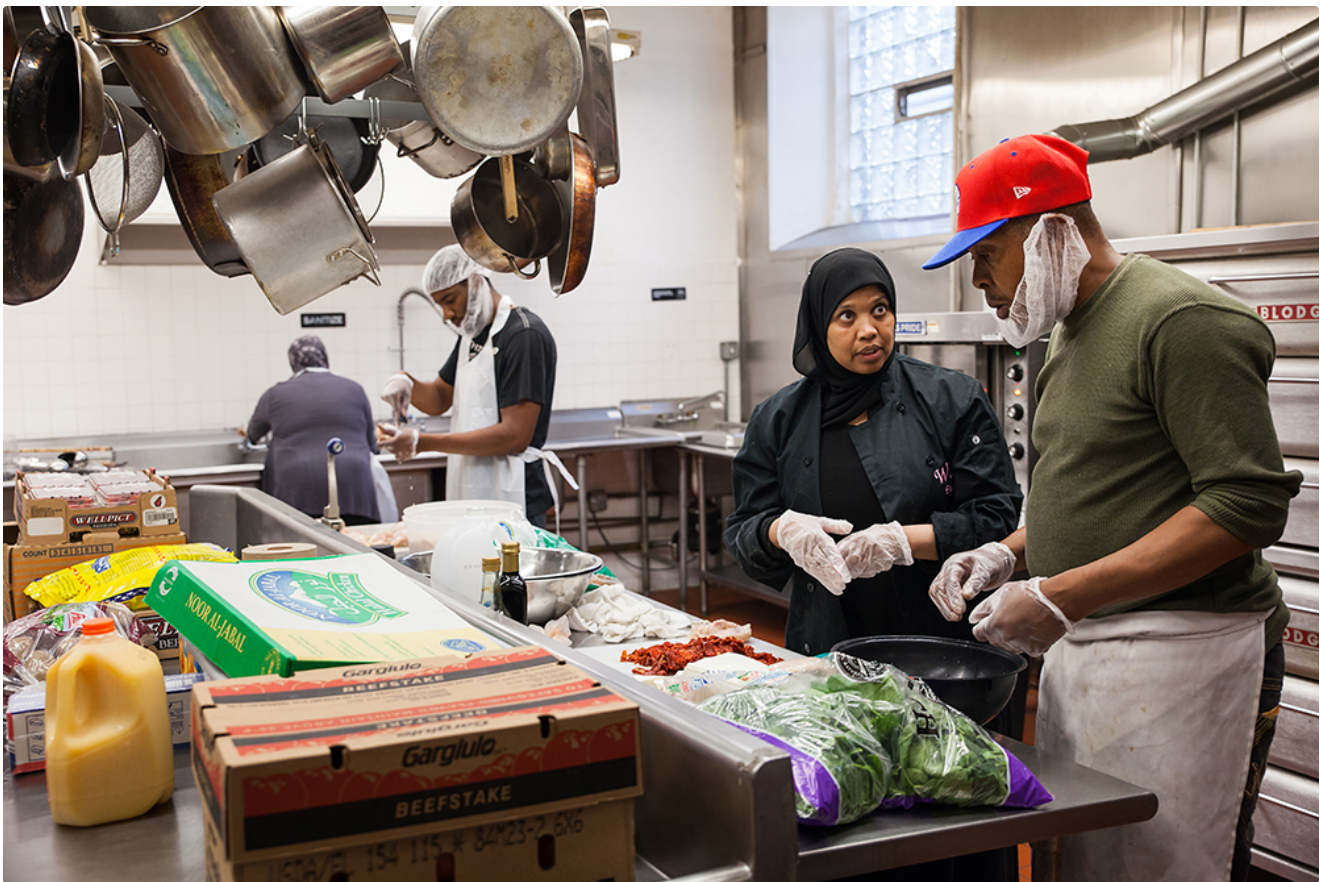
Meals are prepared at the Philadelphia Masjid, one of the properties participating in the Infill Philadelphia Sacred Places/Civic Spaces competition.

At the masjid, this meant learning about its food pantry and culinary training programs, for which the mosque had already invested $300,000 in kitchen improvements and other renovations.