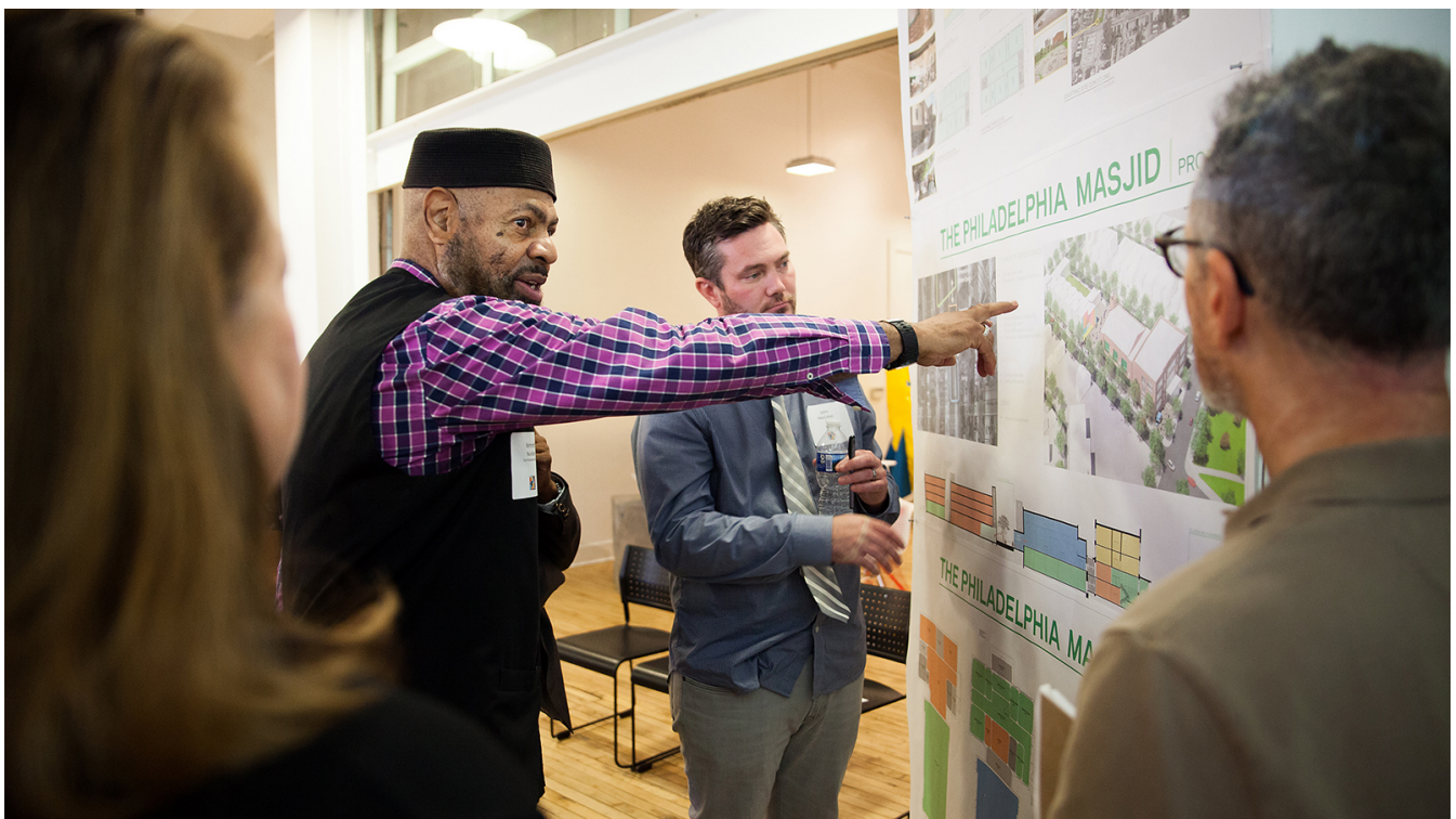
People participate in a review of plans for the Infill Philadelphia Sacred Places/Civic Spaces