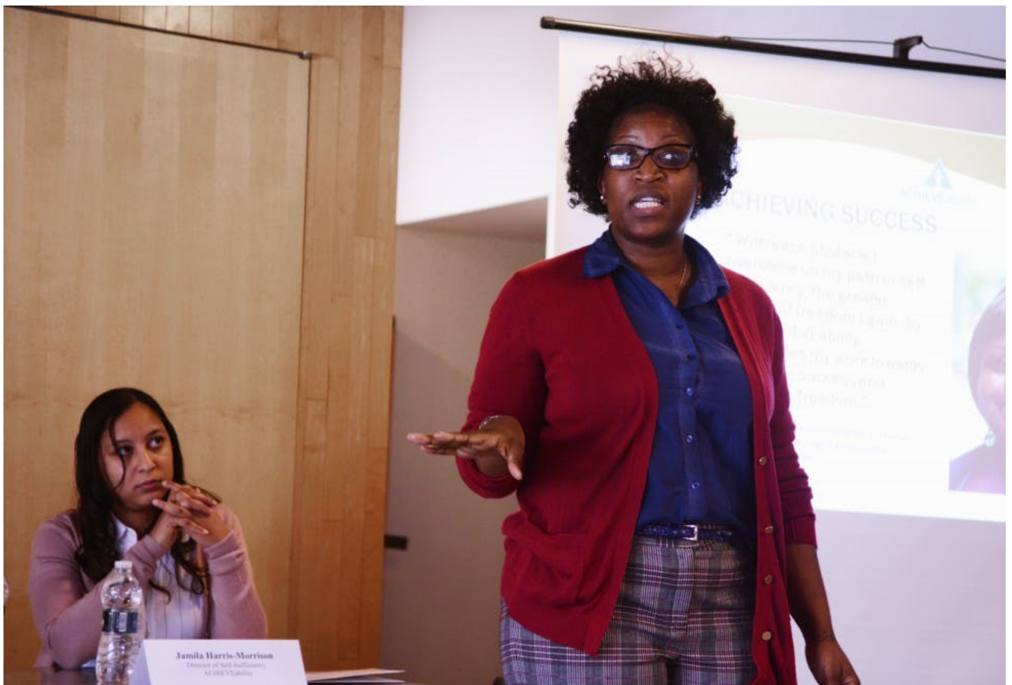
ACHIEVEability Lunch Panel