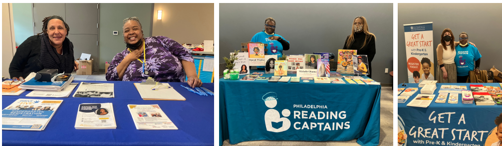
ACHIEVEability staff (left), West Philadelphia Reading Captains (center), and Philadelphia School District (right).

On March 15th, ACHa welcomed over 100 families to shop great goods, like diapers from Cradles to Crayons, pantry items from Keep it Real Ministry, and clothing from URBAN. The Philadelphia School District assisted parents in registering for early childhood education programs while West Philadelphia Reading Captains shared Women's History Month literature and learning resources. Neighbors attended weatherization workshops to reduce home energy bills, accessed utility grants, and received foreclosure prevention resources.