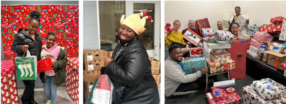
A family with holiday gifts (left), a turkey recipient (center), and the ACHIEVEability & URBN teams with gifts (right).

In an ongoing effort to promote community engagement and help West Philadelphia residents stay safe, stable, and healthy in their homes, ACHa hosted our annual Thanksgiving and Holiday Gift Resource Fairs. We provided valuable resources by connecting neighbors to career recruitment, home-buying programs, energy counseling, utility assistance, weatherization workshops, vaccinations, and festivities.